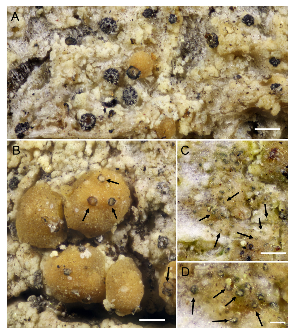
Fig. 2. A–B, Diplolaeviopsis symmictae (holotype), ascomata (with white superficial hairs) and pycnidia (arrows) on Lecanora symmictae . C–D, Everniicola sp. ( Coppins 24107), pycnidia (arrows) on L. symmictae accompanying Diplolaeviopsis symmictae (not visible on photos). Scale bars: A–C = 200 µm; D = 50 µm.